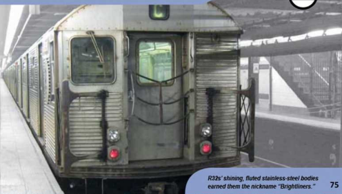
R32s' shining, fluted stainless-steel bodies earned them the nickname "Brightliners."

New York City's subway is one of the world's most celebrated underground networks. Its cars are powered by a third rail on the track, which provides motors with 600V of DC current. The R32s were introduced in 1964 and some are still in use half a century later.