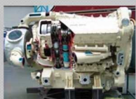
The twin engines each had an output of 1,650 hp.

From the 1960s, the Deltics became a familiar sight on Britain's East Coast Mainline, hauling fast passenger services between London, Leeds, and Edinburgh. Their livery varied over the years, but they were painted in British Rail's blue and yellow colors from 1966. By 1982 the Deltics had served their time. They were succeeded by the UK's Intercity 125 High Speed Trains.