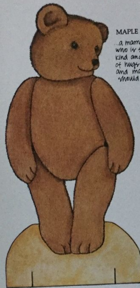
MAPLE M. BEAR ...a mama bear who is sweet and kind and full of hugs - as bears and mamas should be

Copyright © 1983 by Crystal Collins. All rights reserved under Pan American and International Copyright Conventions. Published in Canada by General Publishing Company, Ltd., 30 Lesmill Road, Don Mills, Toronto, Ontario. Published in the United Kingdom by Constable and Company, Ltd., 10 Orange Street, London WC2H 7EG. Teddy Bear Paper Dolls in Full Color: A Family of Four Bears and Their Costumes is a new work, first published by Dover Publications, Inc., in 1983. International Standard Book Number: 0-486-24590-2 United States of America East 2nd Street, Mineola, N.Y. 11501