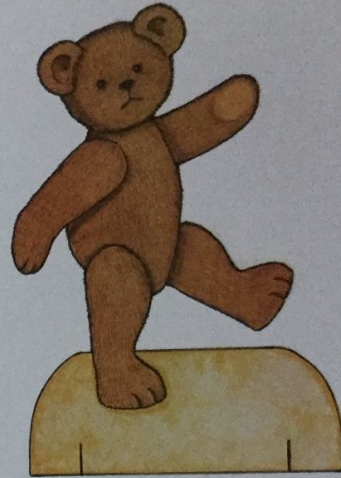
HICKORY B. BEAR ...a small boy bear who is often quite serious and very very proud to be a bear